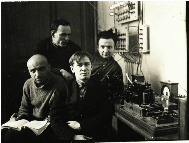
Fig. 1: I. L. Bershtein in 1930 (the left corner in the picture), being a 5th grade university student at the Low Current Lab (a common name for a radio laboratory in those years). This photo is interesting from the historical viewpoint, because the background of a radio laboratory of the 1930's.

Israel L. Bershtein (1908–2000) was one of the famous radio physicists in the world. He had constructed the theory of amplitude and frequency fluctuations for the electromagnetic wave generators working in the radio and optical scales. He also had developed numerous methods for precise measurement of the fluctuations, which also can be applied to ultimate small mechanical displacements. Besides these he was the first person among the scientists, who had registered the Sagnac effect at radiowaves.